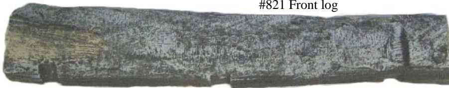
#821 Front log