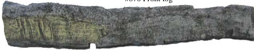
#870 Front log